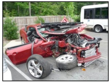
wrecked 2010 mustang gt

The article has been posted and commented on in the "MustangBlog", the source of the original article from July 2009 was retrieved from <a href="http://www.autoevolution.com/news/teens-destroy-a-2010-mustang-in-crash-8766.html">http://www.autoevolution.com/news/teens-destroy-a-2010-mustang-in-crash-8766.html</a>,: article date and author: 14th of July 2009 | 12:05 GMT | Alina Dumitrache, retrieved August, 23, 2010